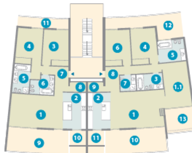
TWO BEDROOM & TWO BEDROOM DELUXE (TYPE B & TYPE D) FIRST FLOOR