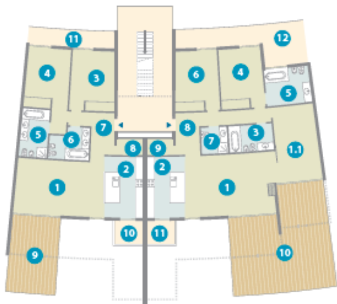
TWO BEDROOM & TWO BEDROOM DELUXE (TYPE B & TYPE D) GROUND FLOOR